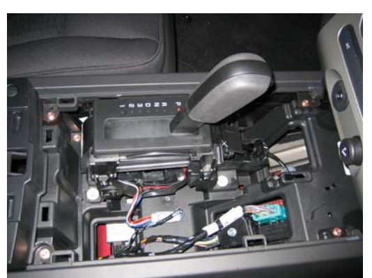
View of panel removed